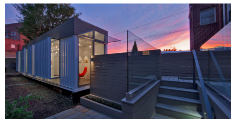
6) 4116 ELLICOTT ST NW WASHINGTON, DC 20016 by Travis Price Architects