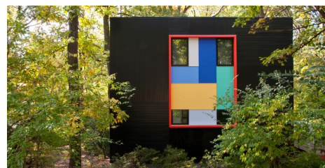
3) 6714 POPLAR AVE TAKOMA PARK, MD 20912 by McInturff Architects