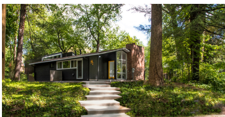
1) 3412 HIGHVIEW CT SILVER SPRING, MD 20902 by KUBE Architecture

presented by: listModern of TTR Sotheby's International Realty