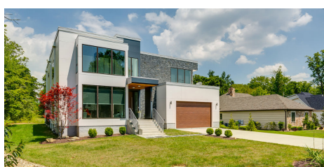
5) 12332 BUNCHE RD FAIRFAX, VA 22030 by Hyun Kim + KCI Design Build