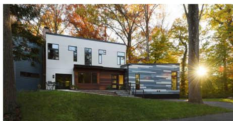
2) 10901 RALEIGH AVE GARRETT PARK, MD 20896 by Jackbird Nest