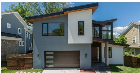
7) 701 WARE ST SW VIENNA, VA 22180 by listModern