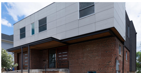
4) 6207 31ST ST N ARLINGTON, VA 22207 by Paola One Design LLC