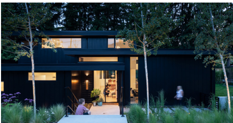
1) 2695 NEWMARKET DR NORTH VANCOUVER V7R 2T2 by Shelter Residential Design Blackfish Homes & Sophie Burke Design SEE PARKING NOTE PAGE 2