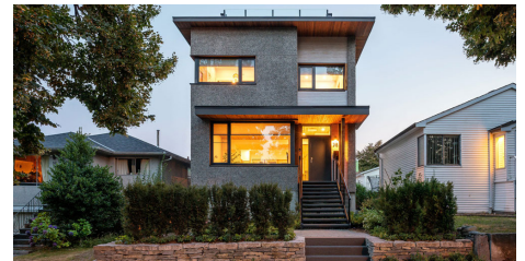
6) 38 E 37TH AVE VANCOUVER, V5W 1E2 by Lanefab Design/Build