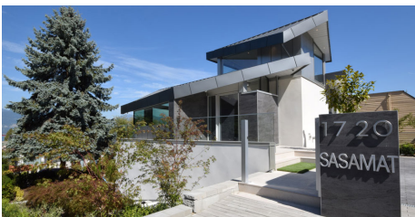
7) 1720 SASAMAT ST VANCOUVER, V6R 4J2 by Frits de Vries Architect Ltd. GET YOUR FREE ISSUE OF WESTERN LIVING HERE