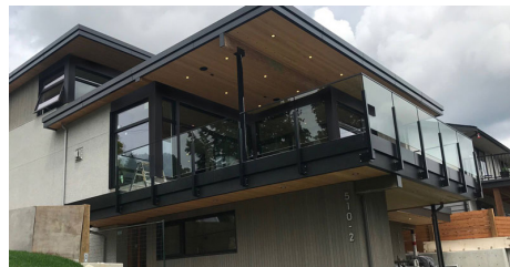
2) 510 KENNARD AVE NORTH VANCOUVER, V7L 4G8 by ONE SEED Architecture + Interiors