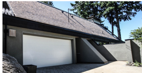
5) 5770 SEAVIEW RD WEST VANCOUVER, V7W 1P8 by Architecture Building Culture SEE PARKING NOTE PAGE 2