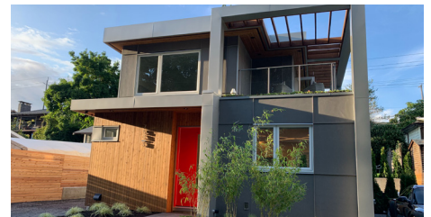
3) 753 4TH ST E NORTH VANCOUVER, V7L 1K1 by Synthesis Design Inc. SEE PARKING NOTE PAGE 2