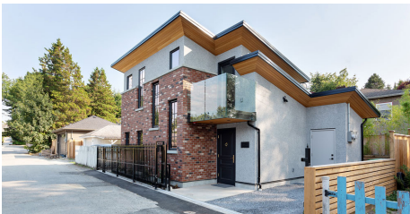
4) 2161 E 20TH AVE VANCOUVER, V5N 2L5 by Madeleine Design Group Inc. SEE PARKING NOTE PAGE 2