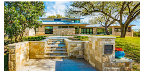
3) 8503 ANDES COVE, AUSTIN, TX 78759 by Barley|Pfeiffer Architecture