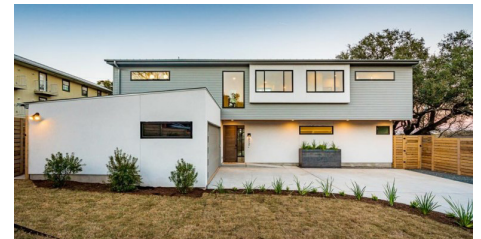
6) 512 S PARK DR, AUSTIN, TX 78704 by Newcastle Homes