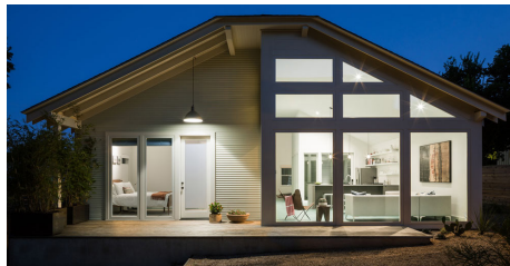
5) 2006 NEW YORK AVE, AUSTIN, TX 78702 by Texas Construction Company