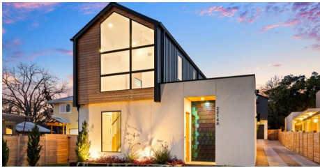
13) 2214 S 3RD ST, AUSTIN, TX 78704 by Forsite Studio