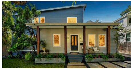
11) 1905 BLUE CREST DR, AUSTIN, TX 78704 by ESS Design+Build