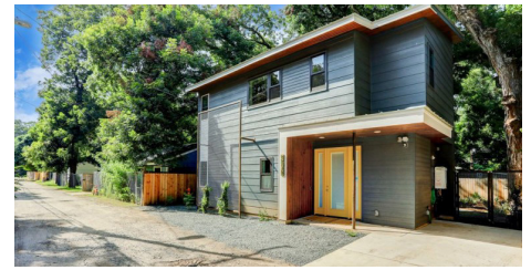
12) 1213 HOLLY ST, AUSTIN, TX 78702 by Okapi Texas / Thoughtcrib