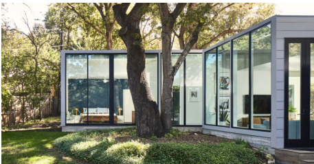
4) 3416 FOOTHILL TER- RACE, AUSTIN, TX 78731 by Bercy Chen Studio