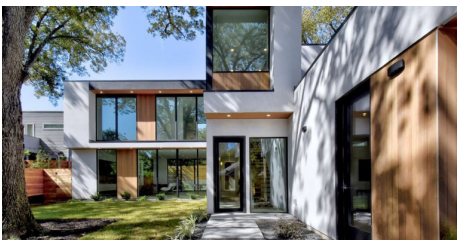
7) 1608 S 2ND ST, AUSTIN, TX 78704 by Joseph Design Build