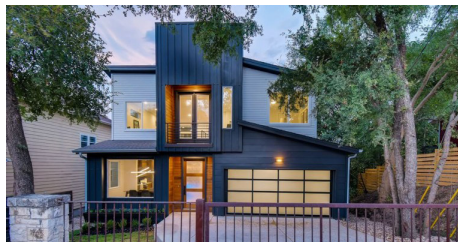
2) 1111 LOTT AVE, AUSTIN, TX 78721 by Thurman Homes