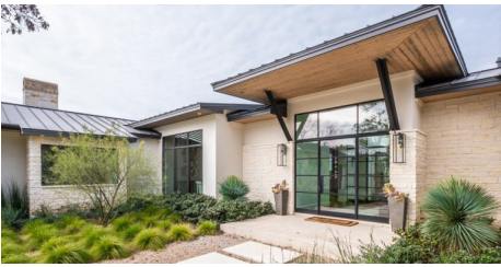
10) 2316 PORTOFINO RIDGE DR, AUSTIN, TX 78735 by Cornerstone Architects, LLP