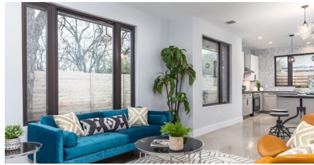
14) 3610 THOMPSON ST, AUSTIN, TX 78702 by Okapi Texas / Thoughtcrib