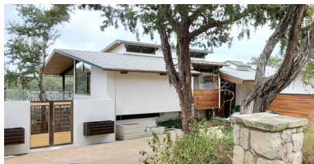
8) 1400 MT LARSON RD, AUSTIN, TX 78746 by LBR Homes